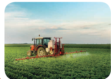
▲ Irrigation System