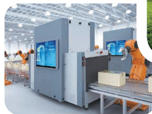
▼ Smart Manufacturing