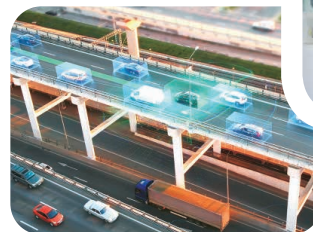
v Traffic Vision