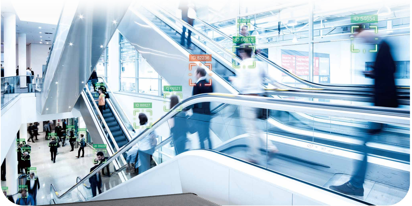
^ AI Surveillance

24-core Foxconn Cortex-A53 MPU with Hailo/Lightspeur AI Accelerator Card Arm-based Edge AI Computing System for Intelligent Surveillance