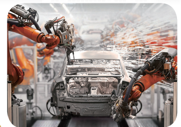
▲ Robotic Control