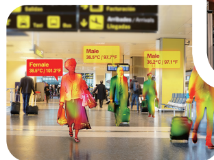
▼ Public Surveillance