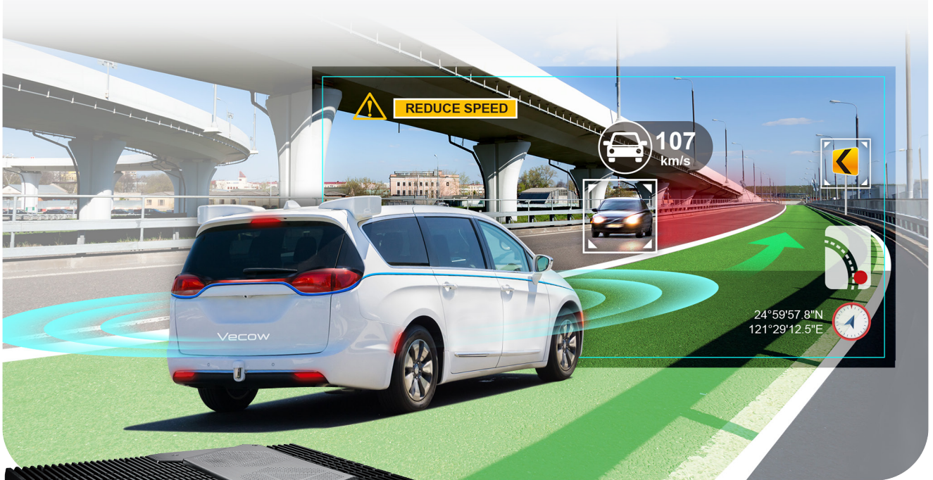
▲ Traffic Vision

AI Computing System with NVIDIA® Tesla®/Quadro®/GeForce® Graphics