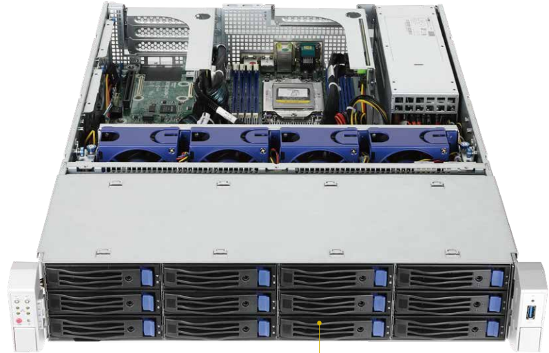
12x3.5" HDD/SSD bays