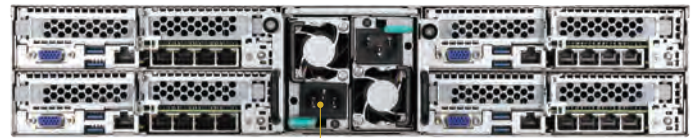
2x 1200W PSU (1+1 Redundant)