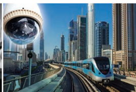
ITS (Intelligent Transportation System)