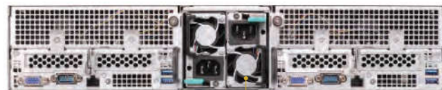
2 x 1600W PSU (1+1 Redundant)