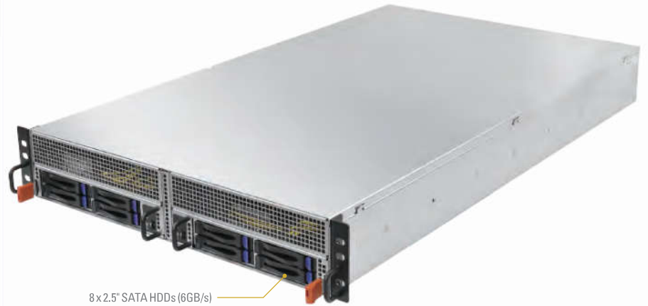
8 x 2.5" SATA HDDs (6GB/s)