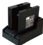
2-bay Battery Charger