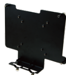
VESA Mount Bracket