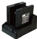
2-bay Battery Charger