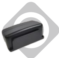
MSR + Barcode Reader